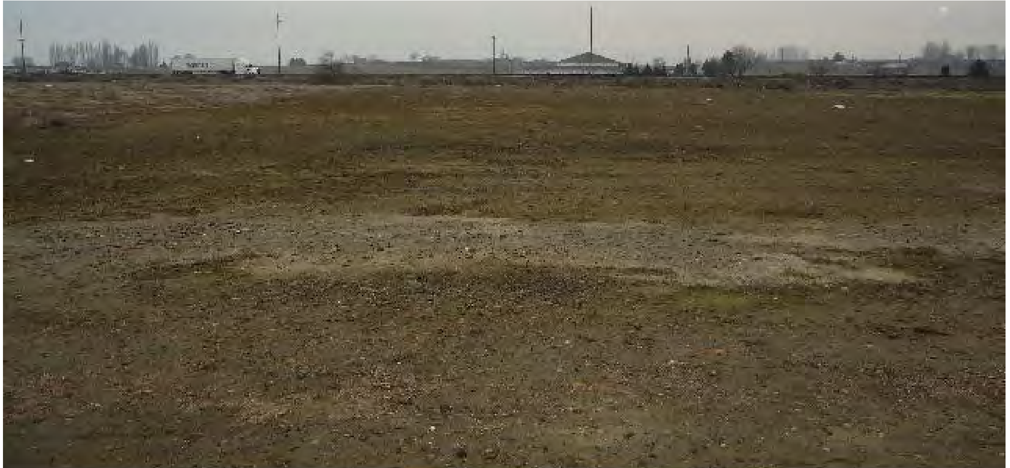
Looking North from Picard Place