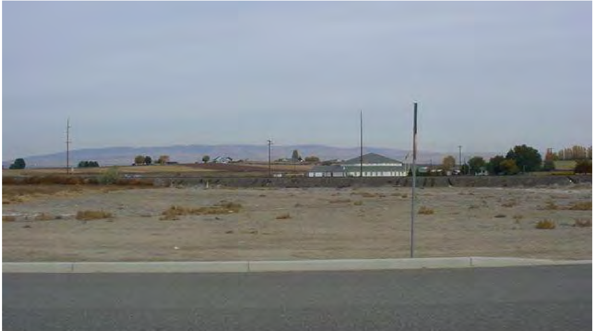
Looking North from Picard Place