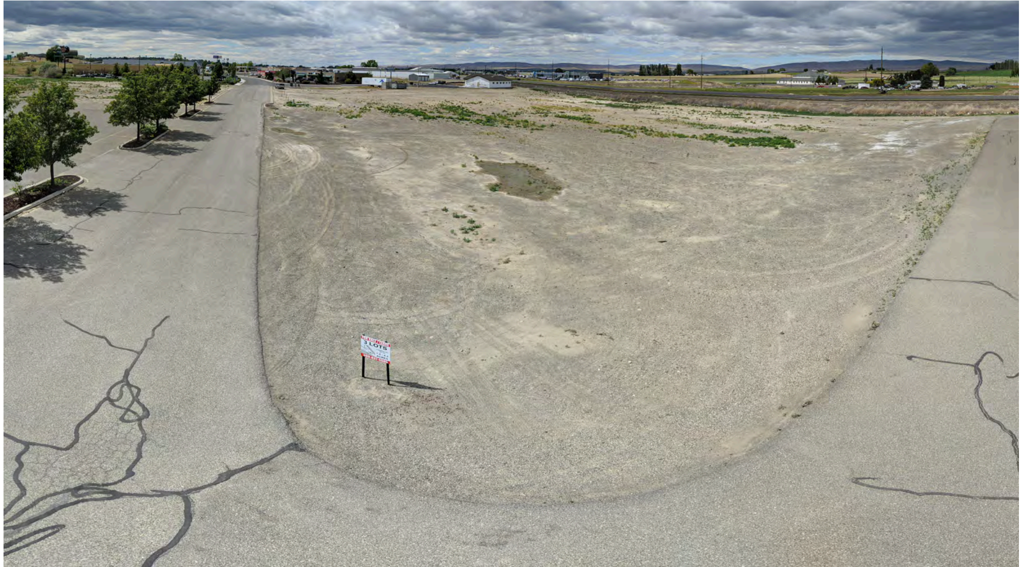
Looking NW From Grand Cinemas Parking Lot