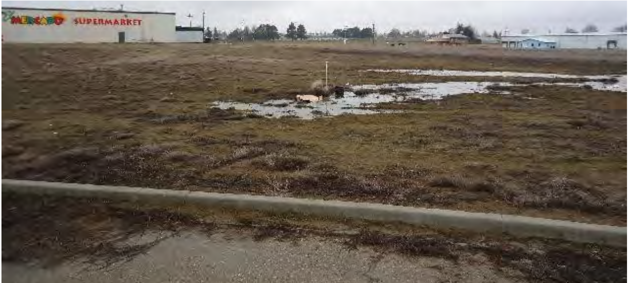
View toward Lot from Driveway