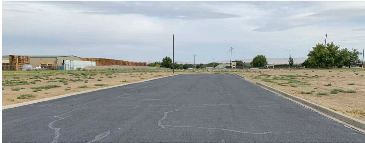
Looking N along access road