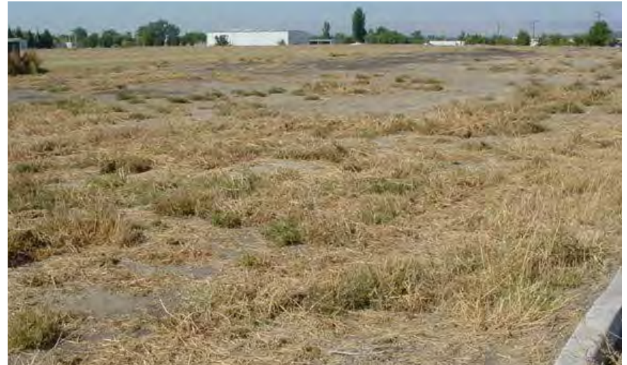
Looking W from access road