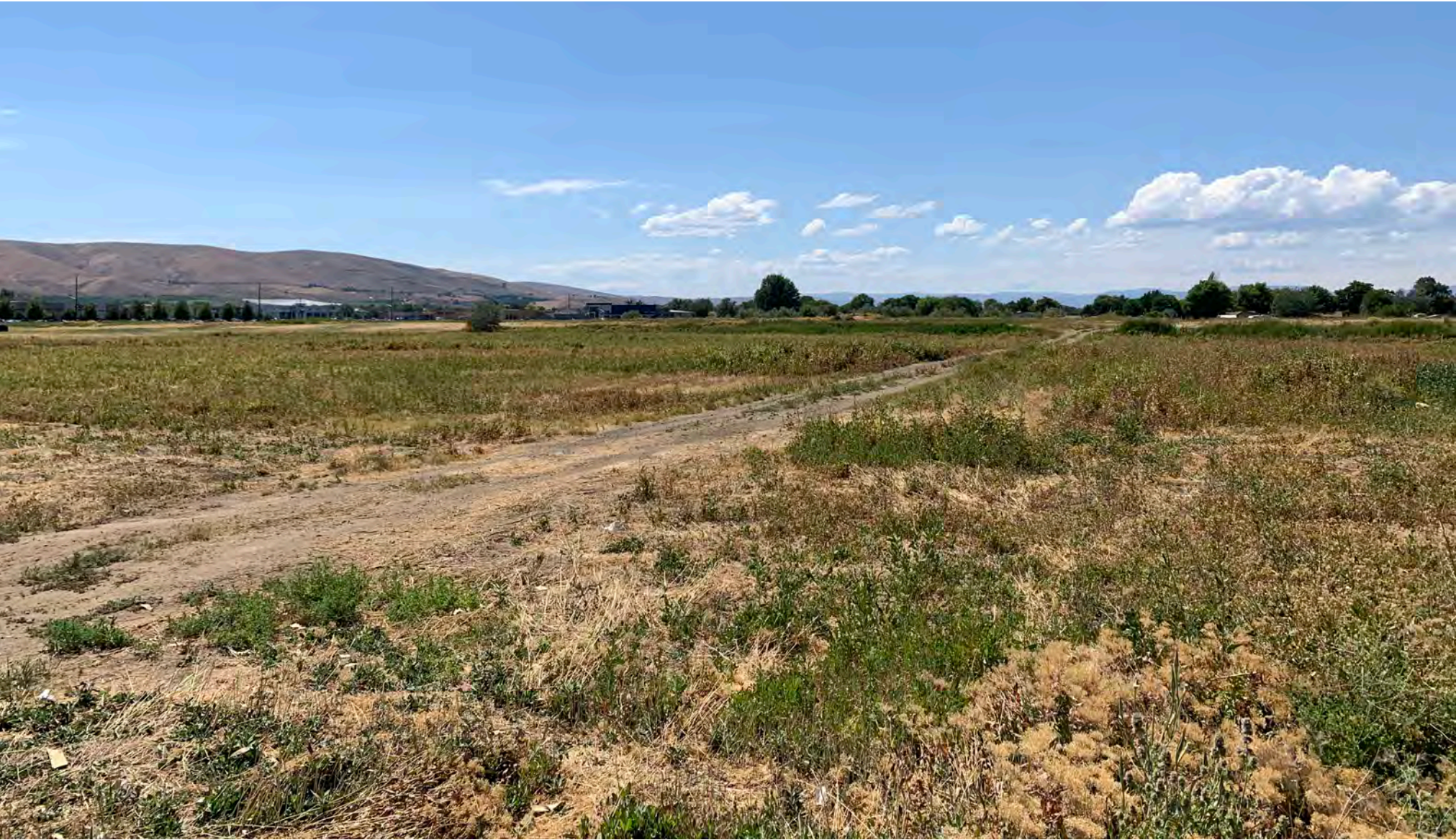
Looking Southwest at Lot 3 from Longfibre Rd