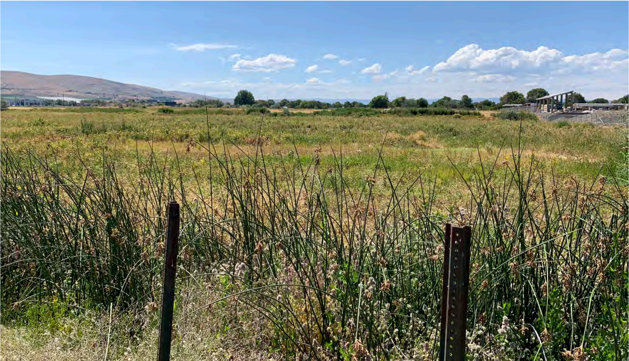
Looking West at Lot 2 from Longfibre Rd