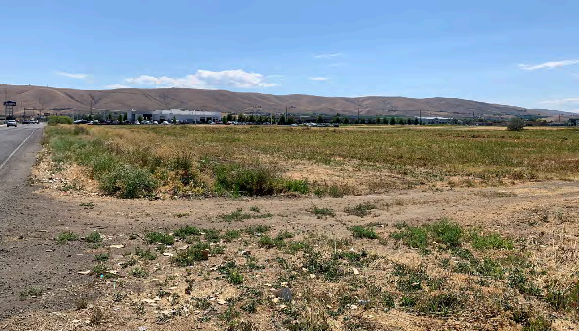
Looking South at Lot 3 from Longfibre Rd