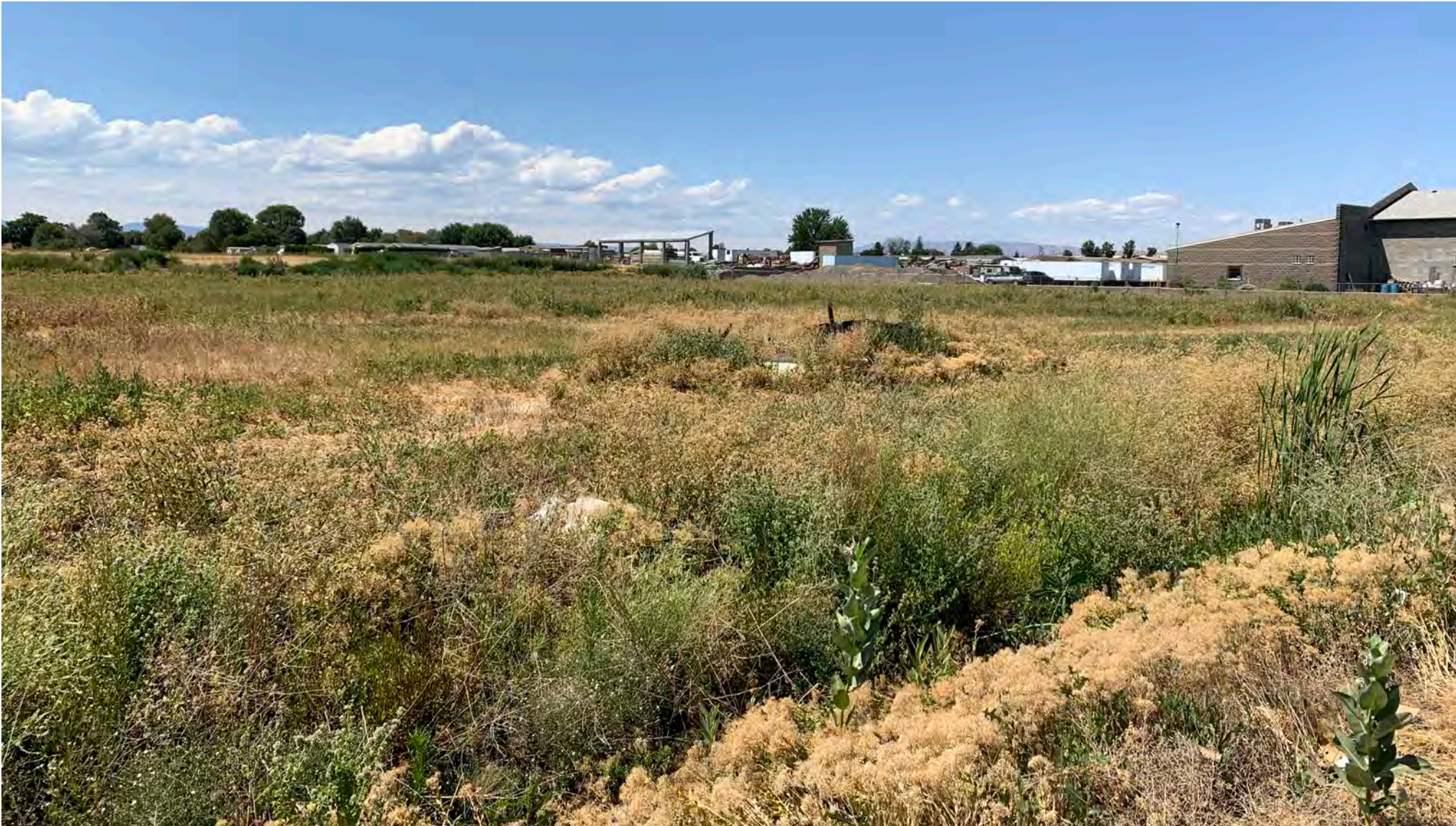
Looking Northwest at Lot 2 from Longfibre Rd